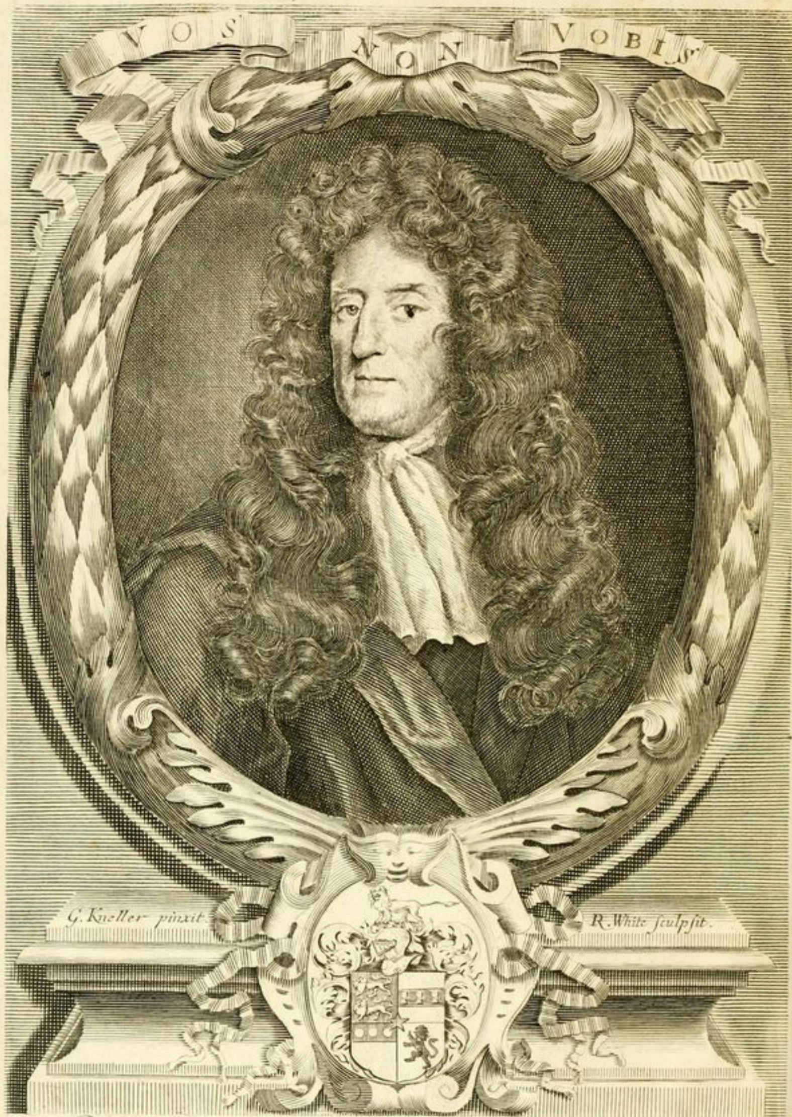
S r Roger L'Estrange Kn t .