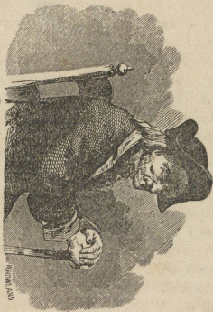
Portrait of Uncle Ned.