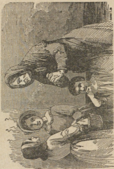
Kind little Girls relieving the Poor.