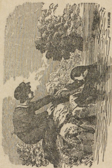
Ned rescuing Jack from drowning.