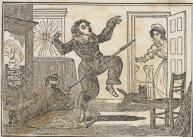
BURNT BY THE POKER. Page 19.