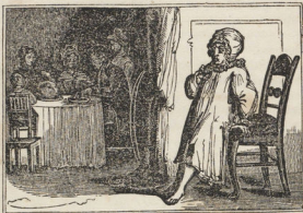
HUNGER AND OBSTINACY. Page 13.