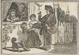
THE OLD PEDLAR.