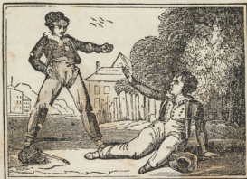
BATTLE OF THE BEACH. Page 14