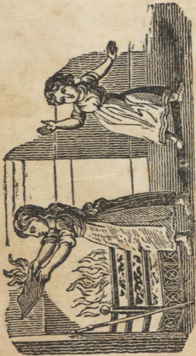
THE CARELESS GIRL PLAYING WITH FIRE.